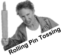
Rolling Pin Tossing